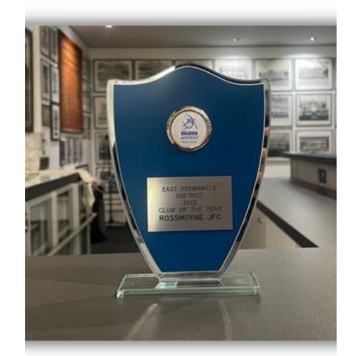
Club of the Year 2022

In 2024 the Club also celebrated 52 years, with many returning players, parents and volunteers attending events and reminiscing about the great times they had playing, coaching and supporting junior footy at Rossmoyne. Our Life Members, including founding members, continue to be a big part of the Club.